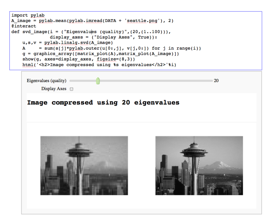
Figure 2: Interactive Image Compression in the Sage Notebook

objects and integrate well with the Sage library. The resulting Python library is called Pynac and is extremely fast and robust. Burcin Erocal, a graduate student at the Research Institute for Symbolic Computation in Linz, Austria, has subsequently worked part time on filling in additional functionality needed to make this library the default library for symbolic manipulation in Sage.